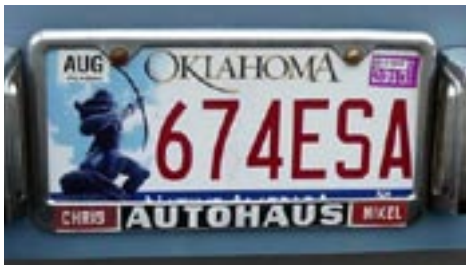
Top: The Mini as MiOne Bottom: The tag frame on the Pickerell's Spider reveals its origin in Tulsa.