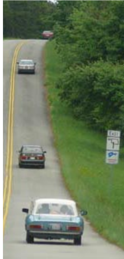
Why we came: Alfas on a hilly, curvy road—the Talimena Trail.