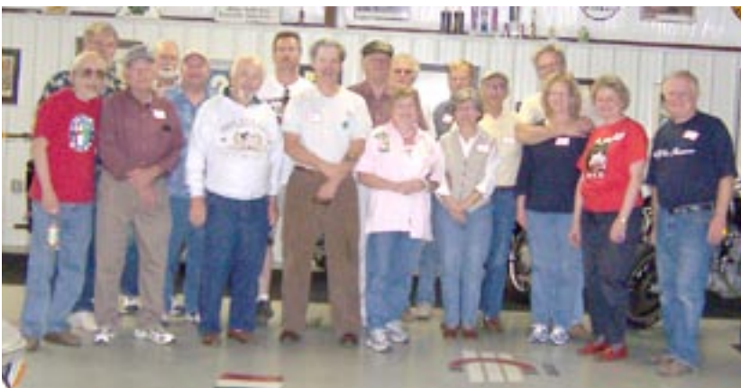
The tour group pauses for a group photo before heading to dinner at an Italian restaurant.